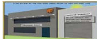
Furniture Making and Design

Effectively combines the competencies associated with the development, costing, prototyping and making of a piece of furniture to meet a customer's needs.