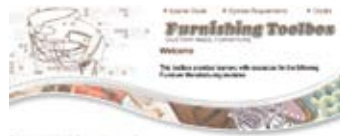
Custom Made Furniture