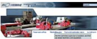
The Turning Force