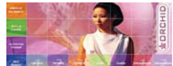
Fashion - Clothing Production