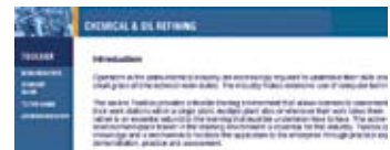
Chemical and Oil Refining