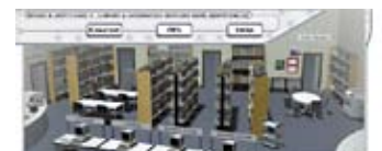
Library and Information Services

Deadly Jam covers competencies from the Music Training Package. Learners interact with characters representing potential careers in the music industry.