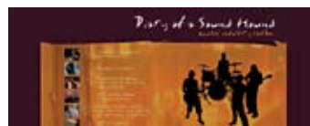
Diary of a Sound Hound