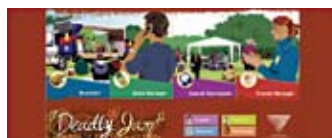
Deadly Jam Music Festival

Diary of a Sound Hound is a resource rich training product that targets young music industry learners seeking skills and knowledge in sound production and project management.